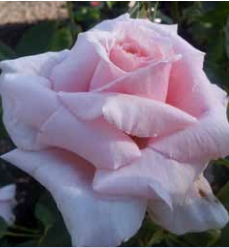
The Children's Rose