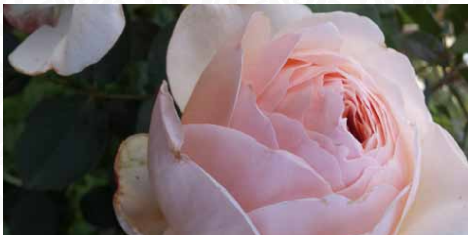
Jude The Obscure