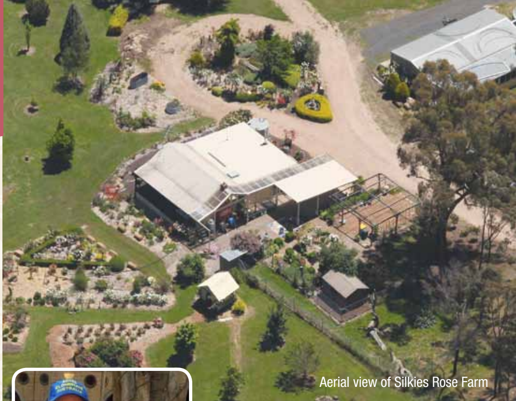
Aerial view of Silkies Rose Farm