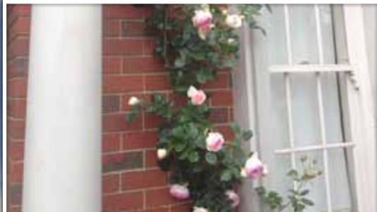
Pierre De Ronsard