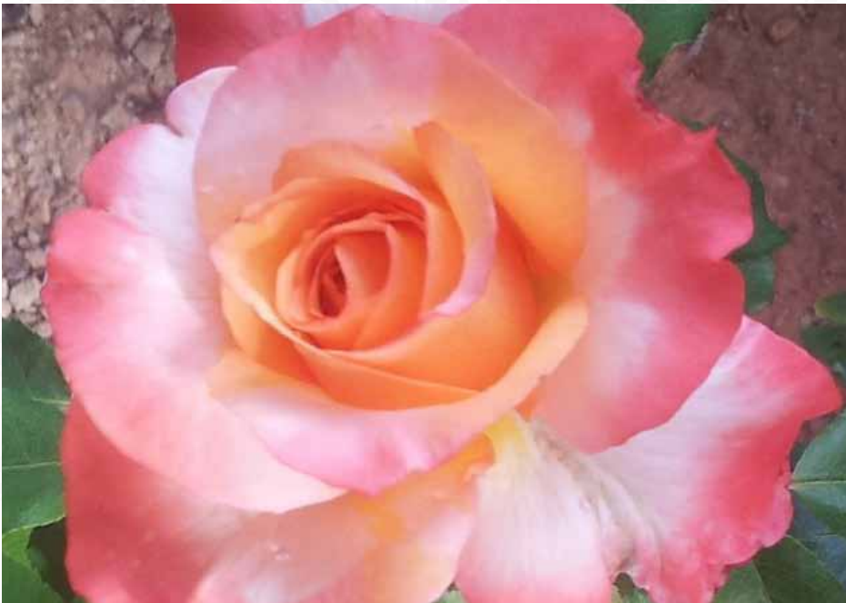
Summer of Love