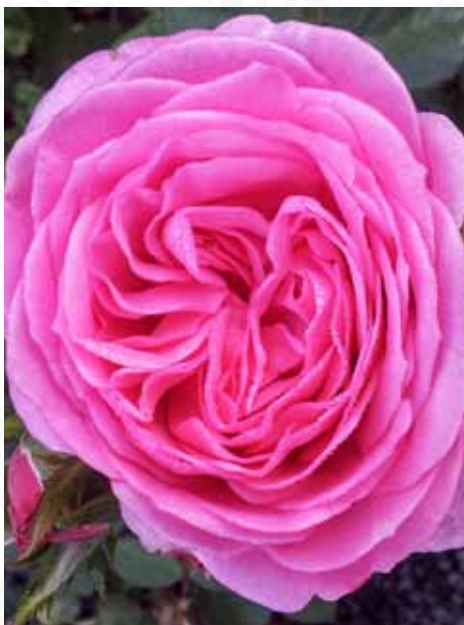
Forget Me Not