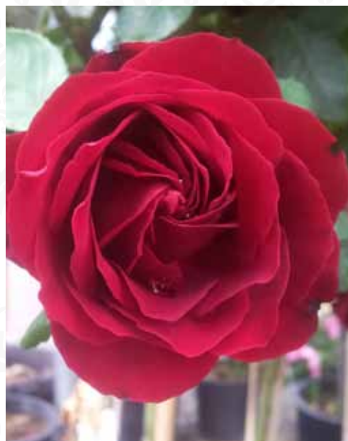
Hommage A Barabra