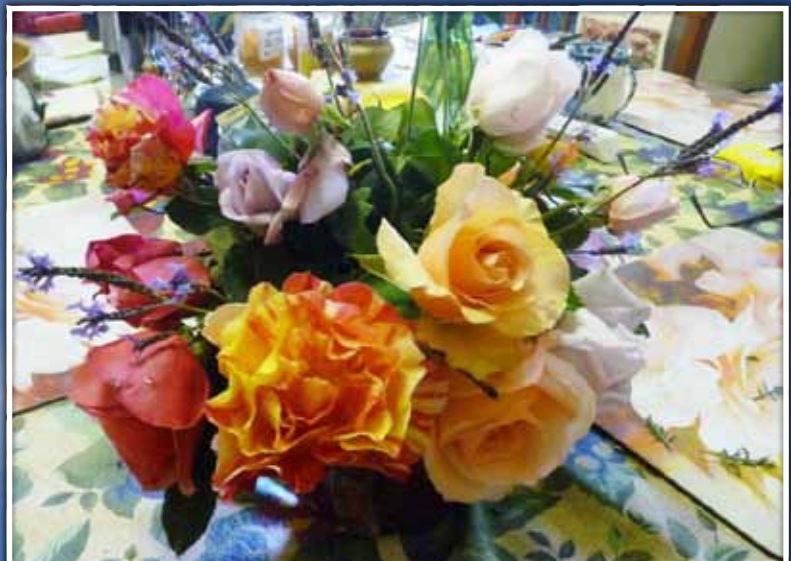
A Vase Of Roses