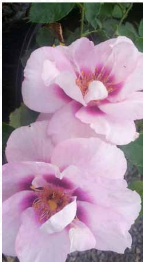
Eyes For You

Take a fresh, open bloom between both hands and take first a light sniff ... are you reminded of citrus, lavender, jasmine, lilac, raspberry, peach, cloves, cinnamon, cedar, moss, vanilla, frankincense or myrrh?