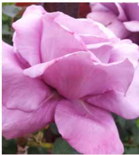
Charles De Gaulle