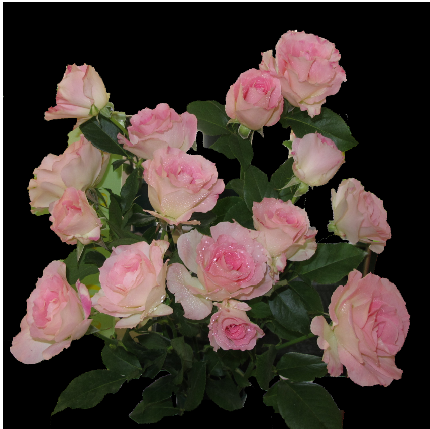
Milk Shake vase

Class 7 – Vase of Floribunda 1-6 stems or cuts same cultivar (all stages preferred)